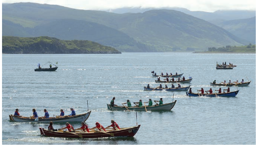
St Ayles Skiffs on Loch Broome in Scotland.

Skiffs became a journey of discovery and adventure.