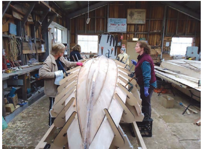
WOW (Women on Water) building Australia's first St Ayles Skiff Imagine at Living Boat Trust Shed, Franklin Tasmania in 2008.

With this decision made, Iain then worked on taking the lines of the Fair Isle skiff and re-drawing it for the much lighter displacement offered by using marine plywood.