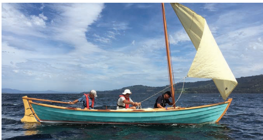
Auxiliary sail rig on Kiwi St Ayles Skiff en route to Franklin.