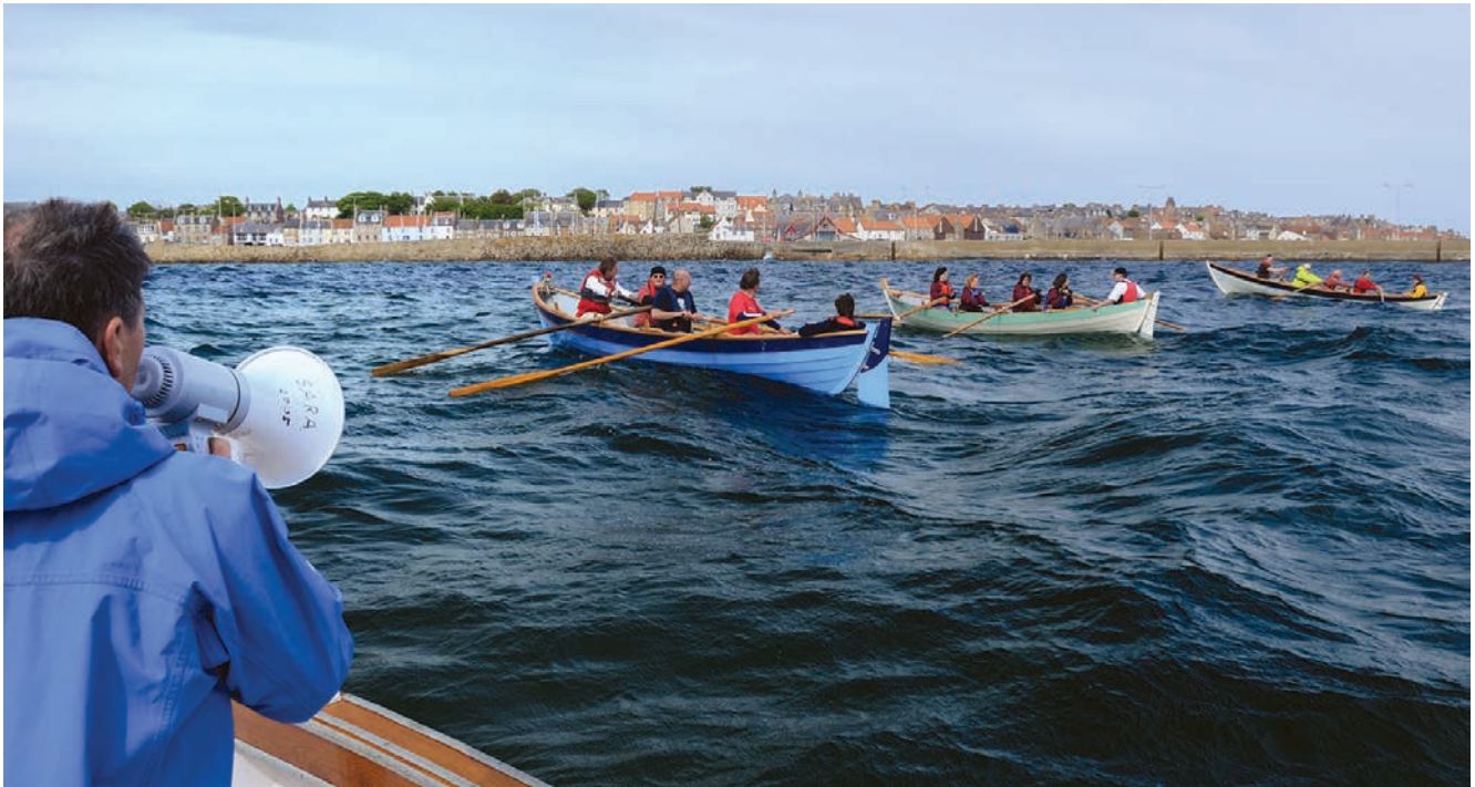
For some, the St Ayles Skiff meant seeing their own coast, from the sea, for the first time — An open water race start in Scotland.