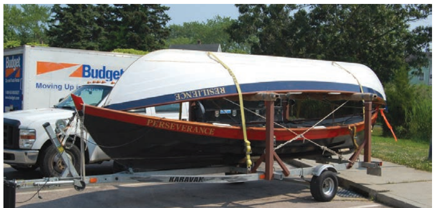
At only 190kg for one St Ayles Skiff, a simple trailer will carry two boats.

The enthusiastic Kiwi response was encouraged by the remarkable generosity