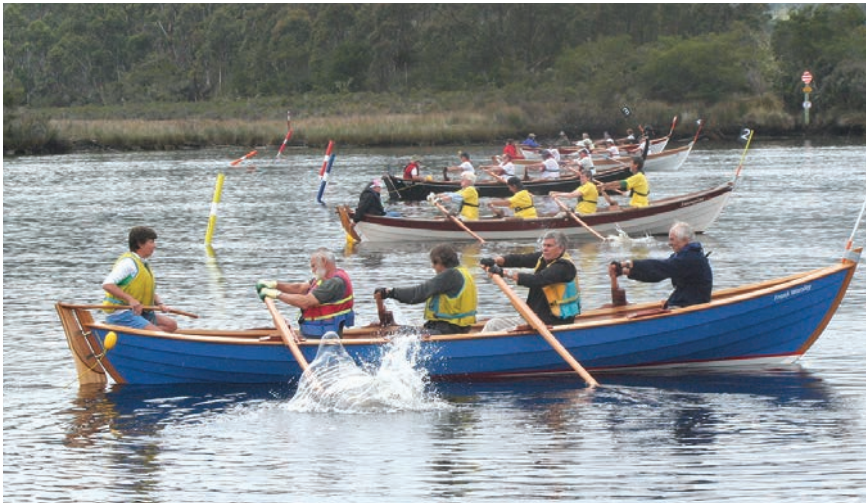
Race Start at Franklin.