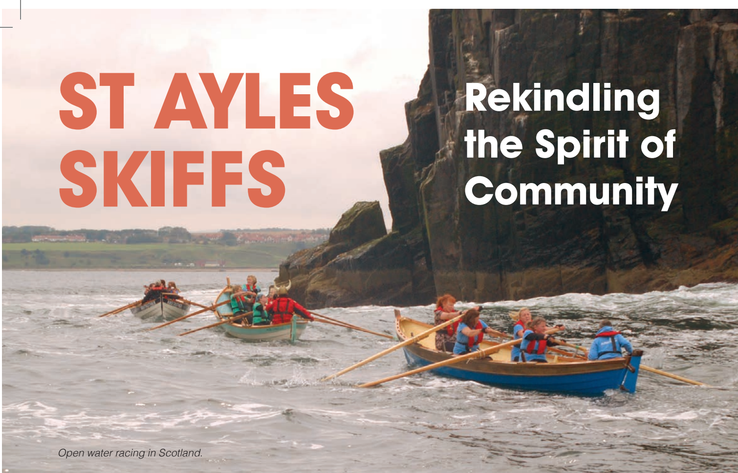
Open water racing in Scotland.

Bruce Stannard charts the extraordinary St Ayles Skiff phenomenon, the fastest growing community-based waterborne activity in the world, and now taking off in Australia.